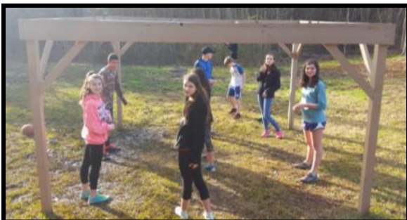
DNOW Fun 2016

We welcome all (6 th grade through 12 grades)