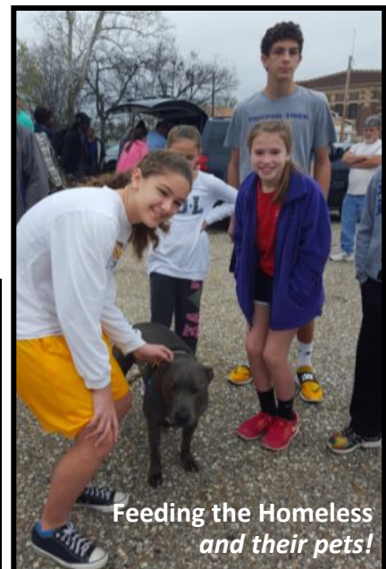
Feeding the Homeless and their pets!